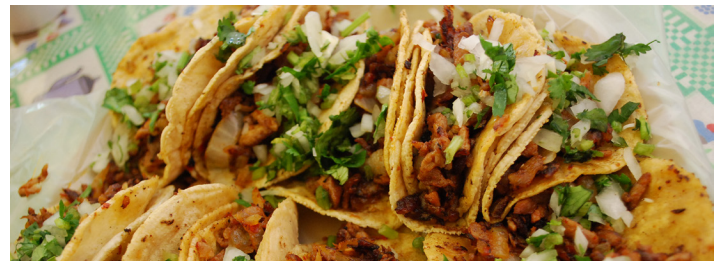
A Midsummer Night's Shabbat & Tacos Friday, July 19, 6:30 pm

Member tickets will be mailed. For guest tickets, please contact the office.