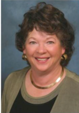
Broker Associate, DRE # 00608658

Helping my Real Estate clients connect to the Jewish Community since 1977